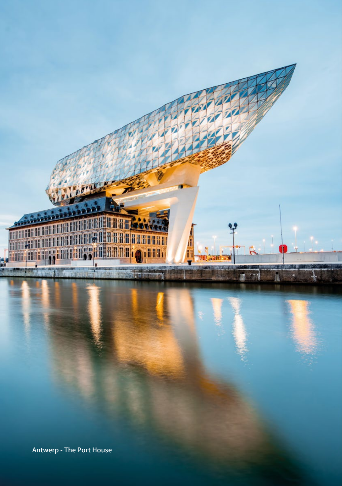
Antwerp - The Port House