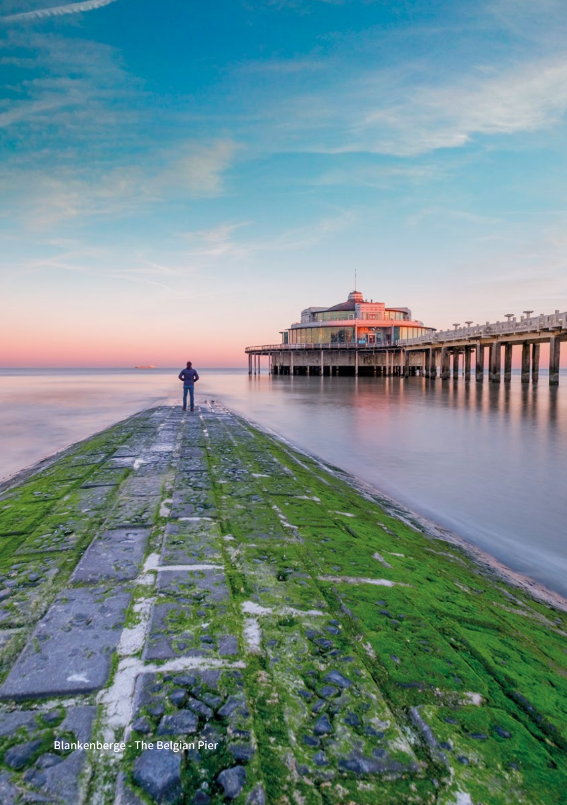
Blankenberge - The Belgian Pier