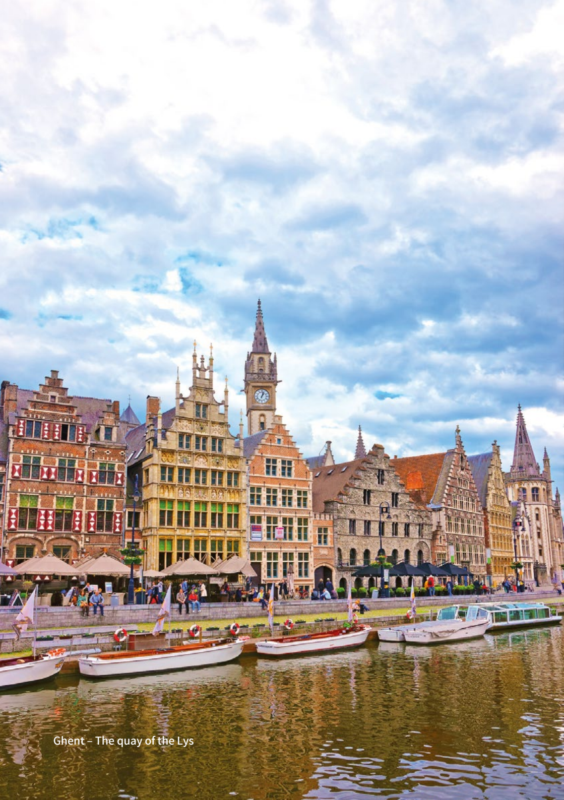
Ghent - The quay of the Lys