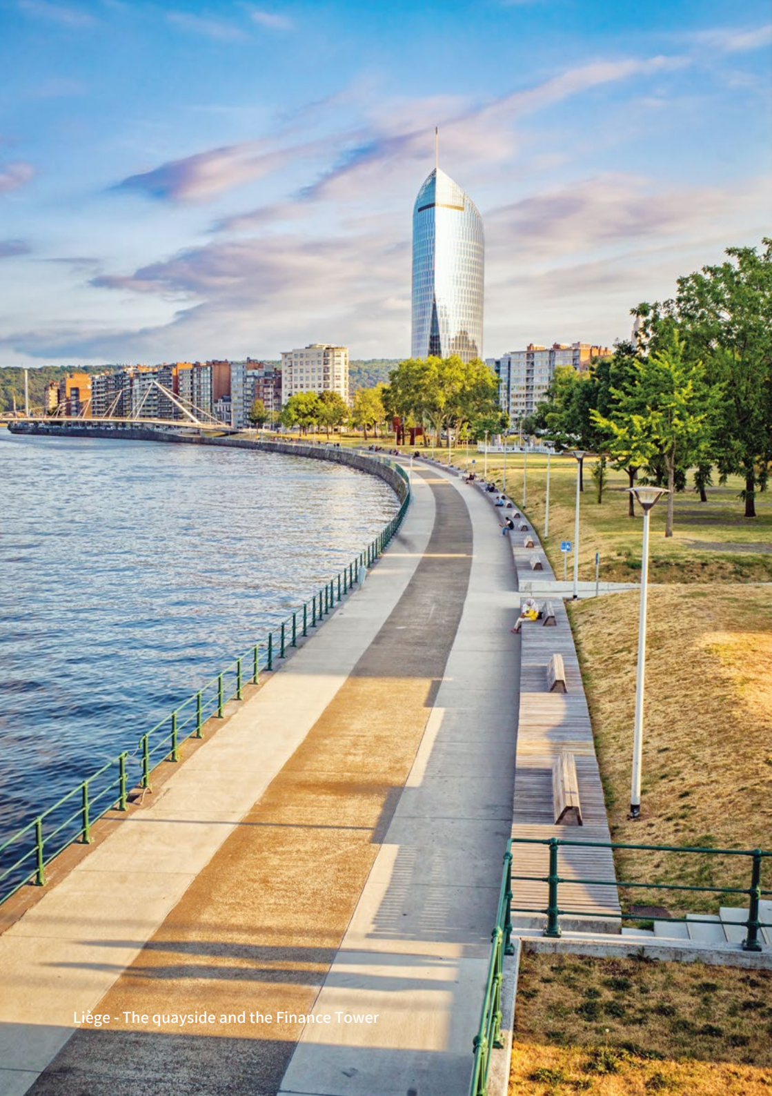
Liège - The quayside and the Finance Tower